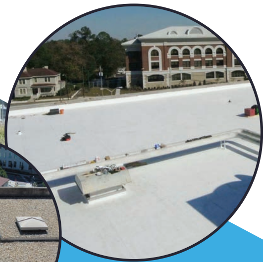
Valdosta Federal Courthouse | Valdosta, GA >> TPO Single-Ply Roof | 32,000 sq. ft.