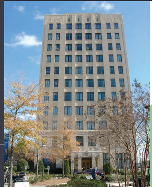
Emory University Hospital Midtown The W.W. Orr Building | Atlanta, GA Exterior Restoration | Historical Building