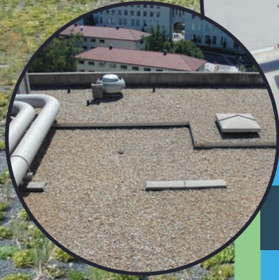
Emory University Hospital | Atlanta, GA >> Ballasted Single-Ply Roof | 25,000 sq. ft.