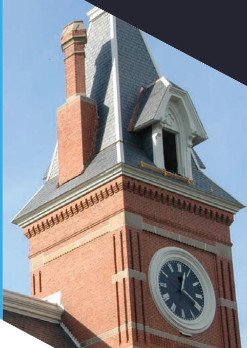
Emory University of Oxford | Oxford, GA >> Slate & Modified Bitumen | Exterior Restoration 26,000 sq. ft. [See Cover photo, also]